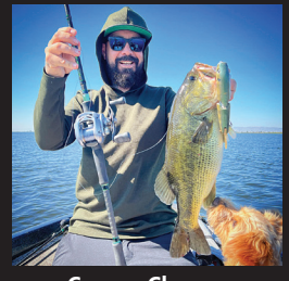
Ceaser Chavez Swimbaits & Cal Delta Expert