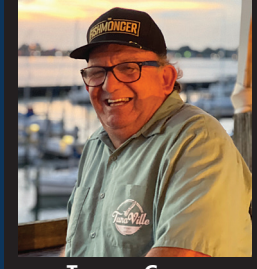
SoCal Trophy Striped Bass Hunter Fish Monger, Seafood Expert, TV Host